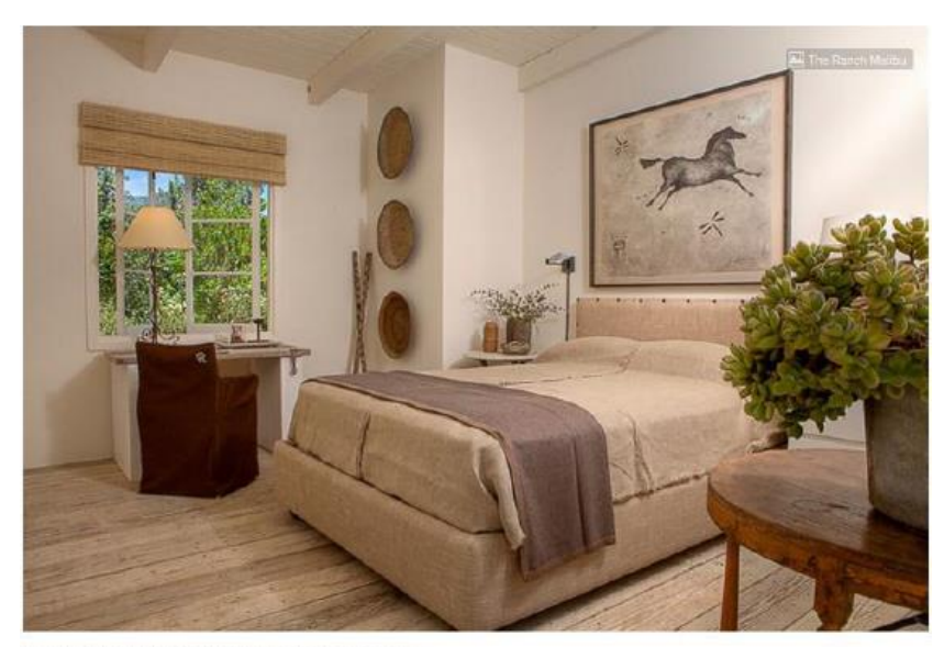
A guest room at The Ranch Malibu is photographed here.

They participate in a stretching session followed by a breakfast from the resort's plant-based menu.