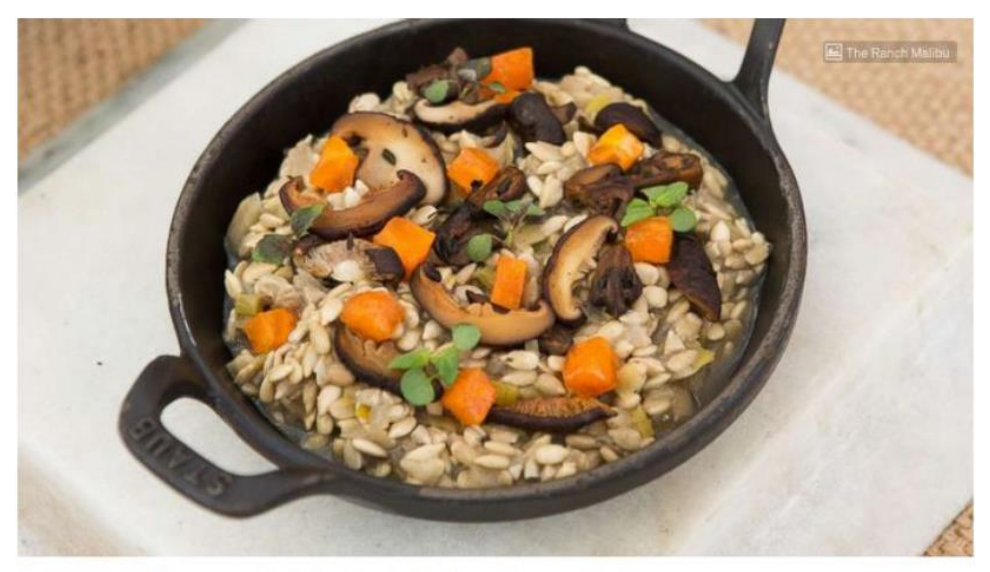
Guests at The Ranch are served plant-based meals, like this sunflower seed risotto.

Guests are treated to a 1,400-calorie baseline plant-based nutritional menu each day, according to Glasscock.