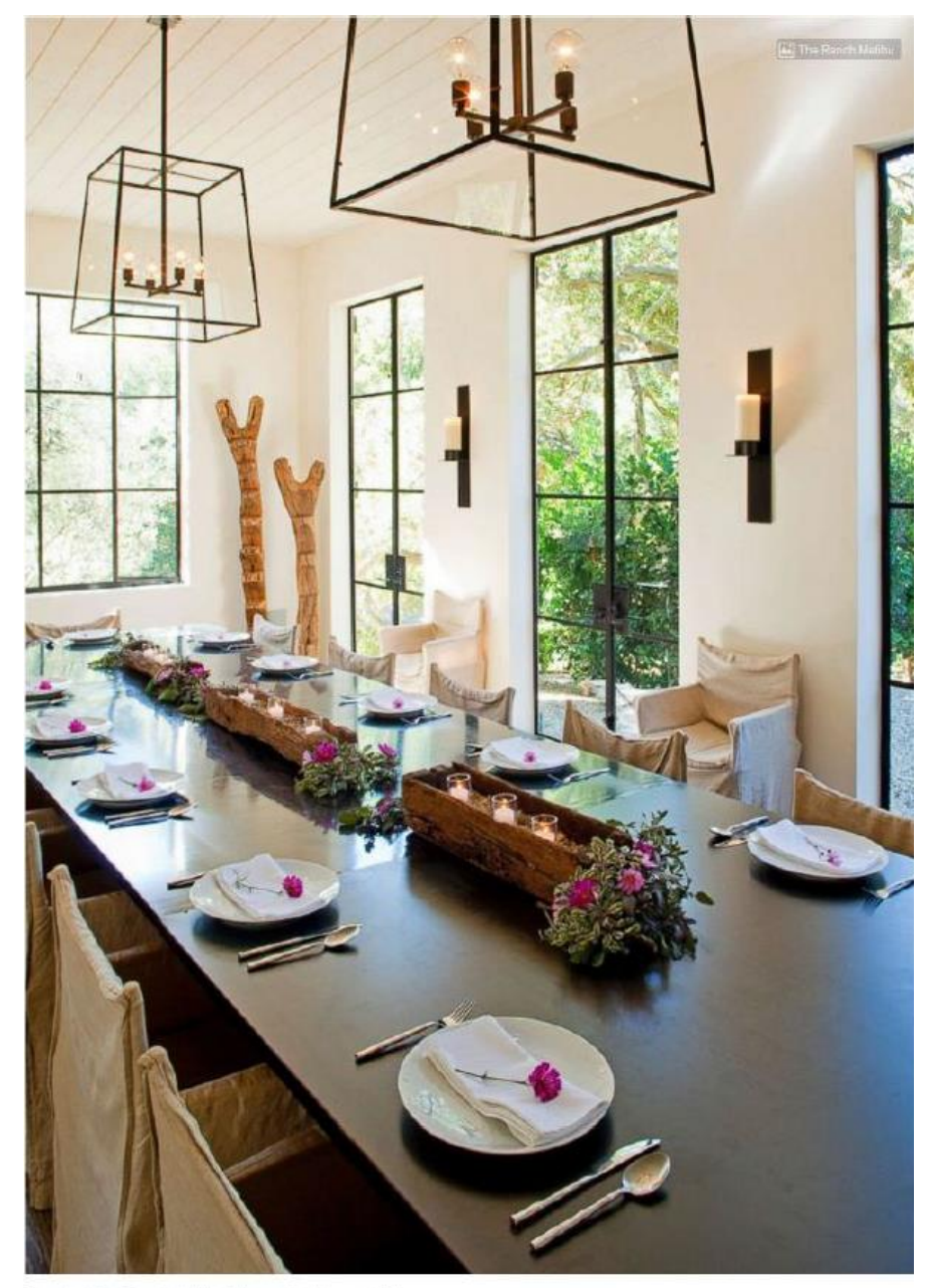
Guests at The Ranch Malibu follow a plant-based diet,

Guests have the option to stay up as late as they'd want, but after the day's activities, most guests are asleep by 9 p.m. at the latest, Glasscok said.