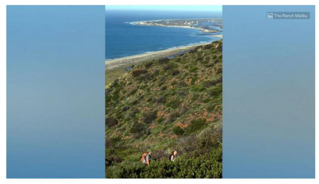
Guests at The Ranch Malibu participate in a daily four-hour hike.

After breakfast, every guest at The Ranch takes off on a mandatory four-hour hike. Guests can hike at their own pace but everyone is out on the trails, according to Glasscock.