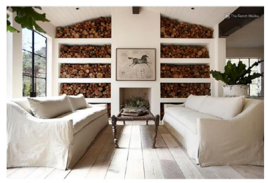
The Ranch Malibu is set on 200 acres and features multiple places to relax.

Set on 200 lush acres in Malibu, the resort serves a clientele that is 75 percent women and ranges in age from 18 to 41.