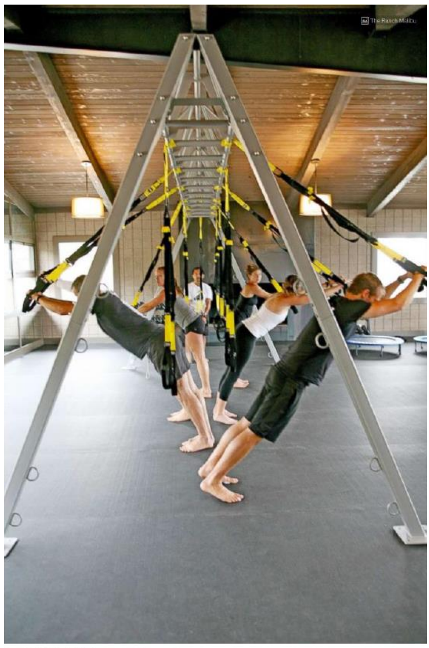
Guests at The Ranch Malibu exercise on the property.

Guests then unwind with a one-hour yoga class followed by a deep-tissue, restorative massage by one of The Ranch's legendary masseuses.